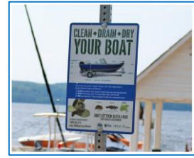
Advancing Science into Action!