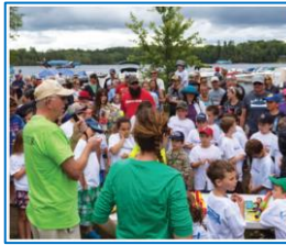
Supporting Volunteer Lake Associations