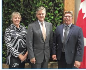
Effective Government Relations