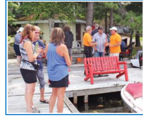
Bridging Gaps in Rural Communities